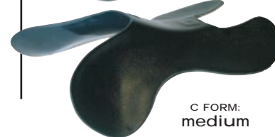
C FORM: medium

Saddle Fitting Kit PART #ABC (3 pc set) $200