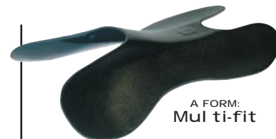
A FORM: Multi-fit

You'll find this emblem on each Fabtron-built saddle in our catalog.