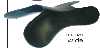
B FORM: Wide