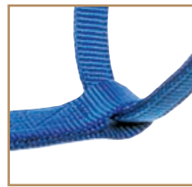
Tough Triple-Ply Construction.