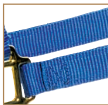
Unique 'Soft' High-Strength Nylon Weave