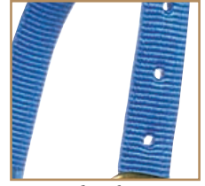
Patented Hole Process for Uniform Neatness