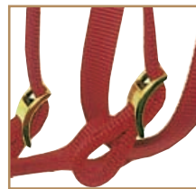
Tough Triple-Ply Construction.