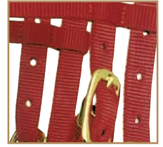
Patented Hole Process for Uniform Neatness