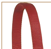
Unique 'Soft' High-Strength Nylon Weave