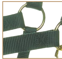
'Box' & 'Cross' Stitched at Major Stress Points