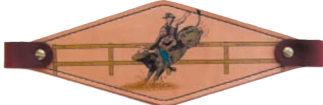
#2 "Bull Rider" Bronc Noseband