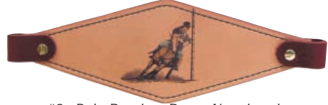
#3 "Pole Bender" Bronc Noseband