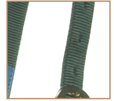
Patented Hole Process for Uniform Neatness