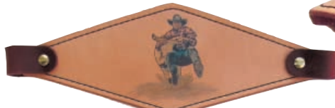
#1 "Bull Dogger" Bronc Noseband

Choose from the standard noseband graphics as shown below: (call for additional graphic options)