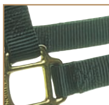
Unique 'Soft' High-Strength Nylon Weave