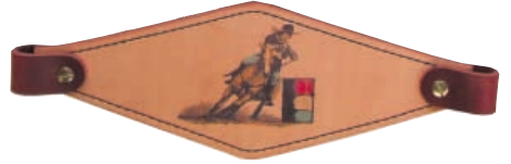
#4 "Barrel Racer" Bronc Noseband

Nylon construction with Latigo-Lined Printed Leather Noseband. Available Standard Horse Size Only (800 - 1100 lbs)