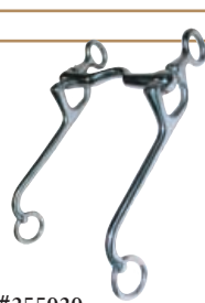
#255020 Stainless Steel Walking Horse bit, 5" low port, 8-1/2" cheeks $35.10

"Grazing Bits" - good bits for well-trained horses that just need a little attention in their mouth.