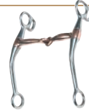
#255130 Stainless Steel 5" Copper Mouth for 6 1/2" Cheeks $29.60