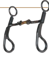
#252940 Blued Steel Colt Bit with 3 piece Snaffle for 6" Cheeks $18.60