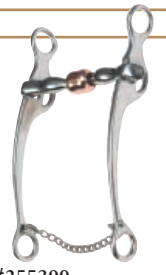
#255390 Stainless Steel 3 Piece with 5" Snaffle for 8 1/2" Cheeks $59.80