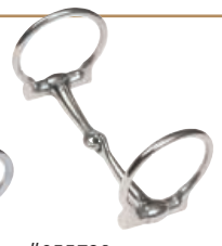
#255730 Stainless steel 5" snaffle mouth, 2-1/2" dee rings $30.60