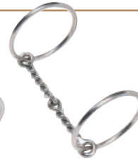
#255454 Stainless Steel 5" Thin Twisted Mouth with 3" Rings $8.50