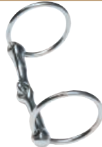
#25228 Nickel Plated Bit. 5 1/4" Snaffle Mouth, 2 1/4" Rings. $7.60