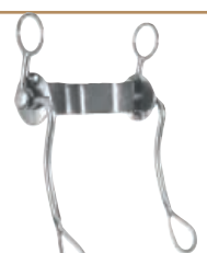
#256350 Stainless steel roping bit with 5" sweet iron mouth, 9" cheeks $39.60