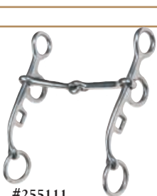
#255111 Stainless steel 5" Argentine bit, thin joint mouth, 6" cheeks $27.00