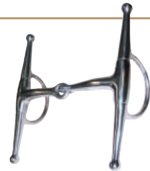
#255160 Stainless Steel Egg Butt bit, 5" Snaffle mouth, 6-1/2" full cheeks $34.20

"Tom Thumb Bits" - Loose-jawed for more flex - extra curb pressure can be applied by the curb ring. Excellent medium-control bits.