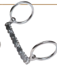
#253140 Chrome Plated Mule Bit $14.40