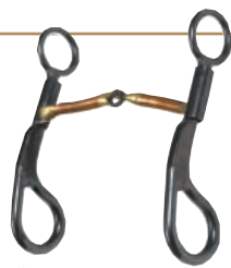
#252850 Blued Steel 5" copper wire-wrapped snaffle mouth, 6" cheeks $17.10

"Colt Bits" - these are some of the most popular colt shanks when leaving the ring snaffle. Good for light, low leverage control.