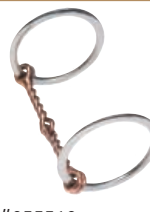
#255512: 5" copper wire snaffle mouth, 3" beveled rings $19.80