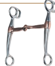
#255850 Stainless Steel 5" Copper Mouth Broken Bit for 6" Cheeks $33.60