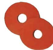
#25453: Red Rubber Bit Guards $1.60