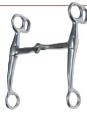
#252110 Nickel Plated Breaking Bit. 5" Snaffle Mouth, 6" Cheeks. $13.20

"Tom Thumb Bits" - Loose-jawed for more flex - extra curb pressure can be applied by the curb ring. Excellent medium-control bits.