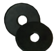
#25454: Black Rubber Bit Guards $1.60