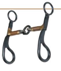
#252771 Blued Steel 5" copper wire-wrapped snaffle mouth, lifesaver bit, 6" cheeks $21.60