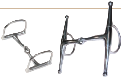
#255440 Stainless steel 5" snaffle mouth, 2-7/8" dees $27.90