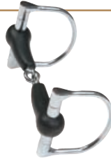
#253450 Chrome Plated 5" Rubber Covered Mouth with 2 7/8" Dees $14.96